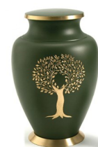
Tree of Life