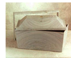
Hepburn Urn Vault