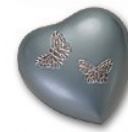
Avondale Teal Butterfly Heart